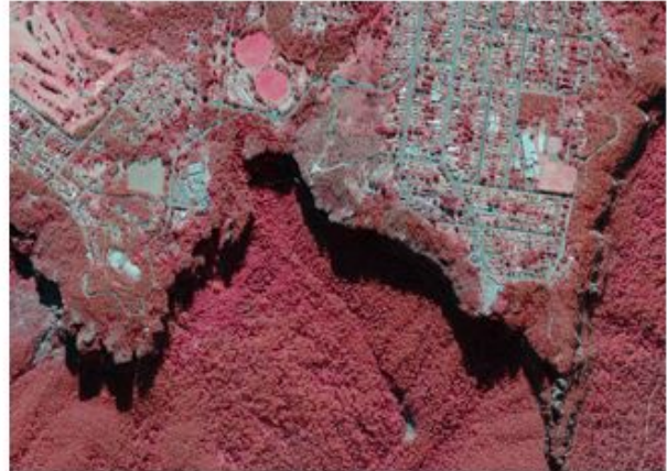
Images depicts a sample of the Standard Aerial Imagery dataset, RGB left, CIR right