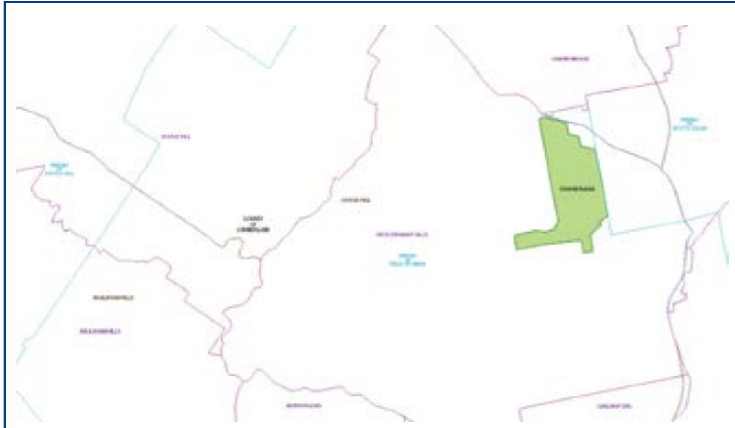
Image depicts a screenshot of the NSW Administrative Boundaries web service